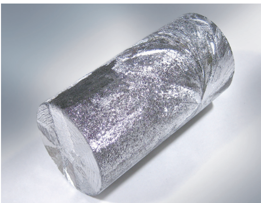
Example: Cylinder 65 mm x 135 mm

Density: 5.72 \frac{g}{cm^3} - 0.23 \frac{g}{cm^3}